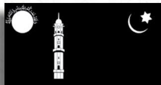
Flag of the Ahmadiyya Muslim Community

The Ahmadiyya Muslim Community was founded in 1889 by the Promised Messiah, his Holiness Hazrat Mirza Ghulam Ahmad of Qadian, (peace be upon him) , whose mission it was to remove misinterpretations and revive the true teachings of Islam, engendering in people's hearts the love of God and the duty to serve mankind.