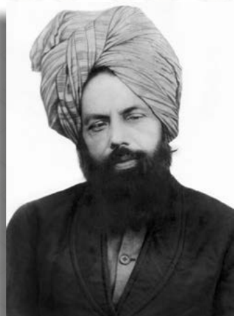
The Promised Messiah (peace be upon him) Hadhrat Mirza Ghulam Ahmad of Qadian (1835-1908)

Throughout the world Ahmadi Muslims have become renowned for their commitment to peace, their law-abiding nature and determination to create a harmonious society for all people, regardless of their nationality, ethnicity or faith.