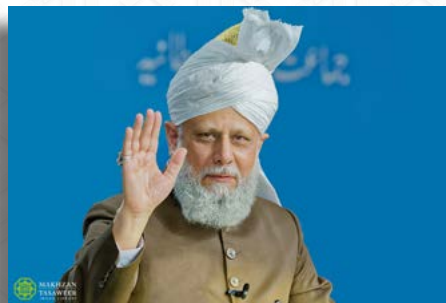
His Holiness Hazrat Mirza Masroor Ahmad (May Allah be his Helper) current worldwide head of the Ahmadiyya Muslim Community

[His Holiness Hazrat Mirza Masroor Ahmad (May Allah be his Helper), ‘Islam and Europe – A Clash of Civilisations?’, Germany, 2020]