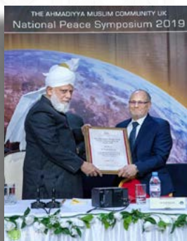
His Holiness Hazrat Mirza Masroor Ahmad (May Allah be his Helper) presenting the Ahmadiyya Muslim Prize for the Advancement of Peace during the National Peace Symposium 2019, UK.

Arabic Calligraphy of the Attribute of Allah ‘As-Salam’ - The Source of Peace.