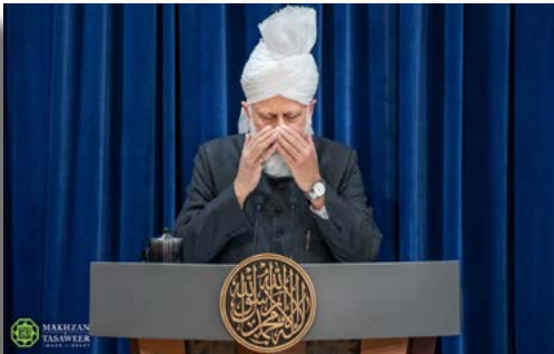
His Holiness Hazrat Mirza Masroor Ahmad (May Allah be his Helper) leading Silent Prayer.

“I pray that a spirit of service to humanity takes permanent root in society, so that we protect our future and leave behind a better world for our children and coming generations to live in.”